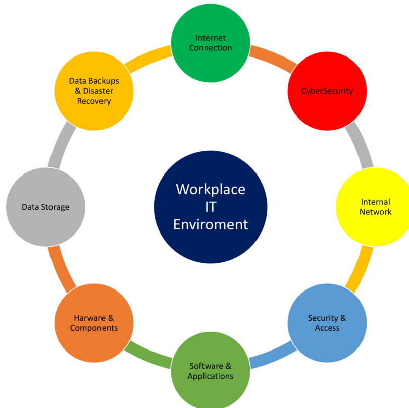
Figure 2 - Workplace IT Environment

The IT Guys understands this environment and has dedicated its resources to recruiting and managing highly skilled professionals that will be able to work as a team to better manage the office of today.